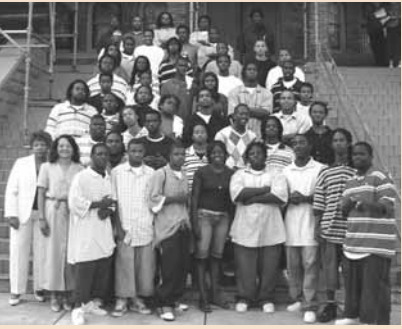
Miles College students attend the BCRI Hurricane Katrina public program on August 29, 2006 held at Sixteenth Street Baptist Church.

BCRI COMMUNITY PARTNERS Alabama Shakespeare Festival Alabama Symphony Orchestra Alys Stephens Center The Birmingham Civil Rights Institute encourages its members/donors and friends to support our partner organizations. Call the Institute at (866) 328-9696, ext. 236 for more information.